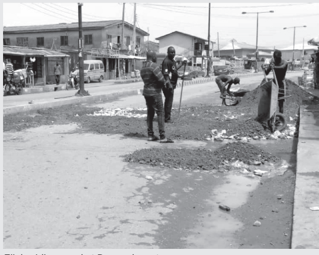
Ejigbo-Idimu road at Dorcas bus stop

He also wants the government to reduce the administration for doing a different charges collected follow-up on the general from the motorists in the name wellbeing of the masses as of the government and